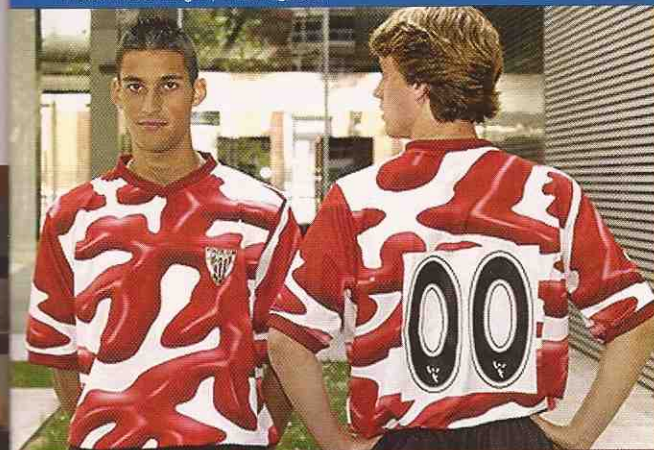
Athletic Bilbao: Cool shirts... eh... hombre!